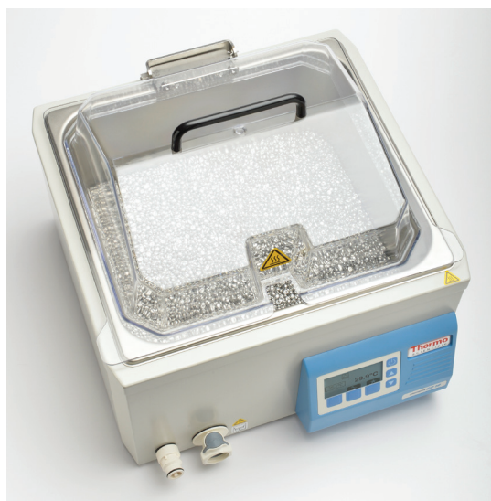
Precision™ General Purpose Water Bath TSGP10

Thermal beads are small aluminum alloy beads that act as a thermal conductor. Because of the size, shape and density of the beads, vessels of any size or shape that fit into the bath can be held in place by the beads without floating. The beads reduce the risk of contamination because there is no liquid to circulate the contamination to the other vessels or promote biogrowth and they can be sterilized chemically.